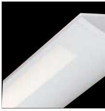
Arcos™ Perf II, P-I-5900 Pendant Indirect