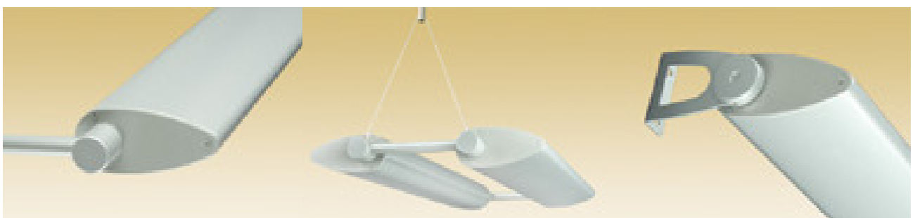
Wall Hub (WH)