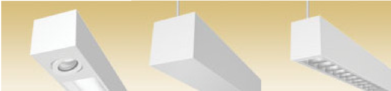
Edge EX44 with MR16