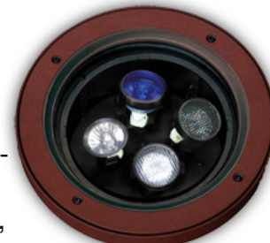
(MR 16 Quad)