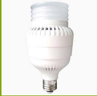
BU Series Ultra Performance LED Lamp 30w/40w/50w 6000/3000k