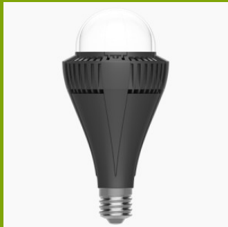
BX Series Ultra Performance LED Lamp 100w 5000/3000k